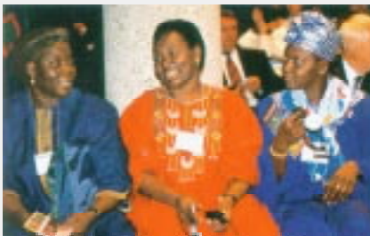
Some of the participants...